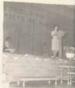
Don't look so nervous!