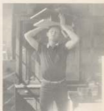
Strictly for the Birds!!