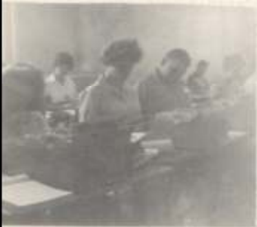
Hard at work!!!