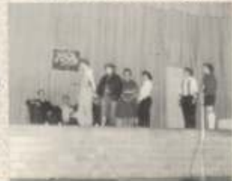
Warner Brothers Presents