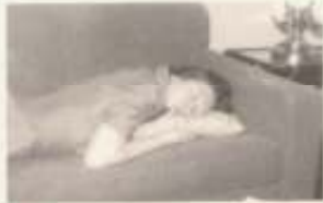
Long hard night!!