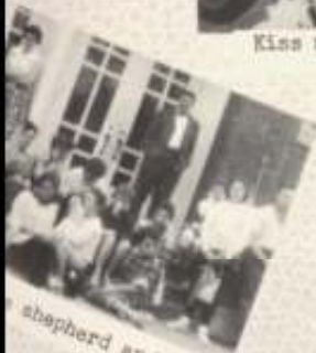
shepherd and his flock