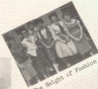
The Height of Fashion