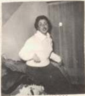
Kiss me quick!!!