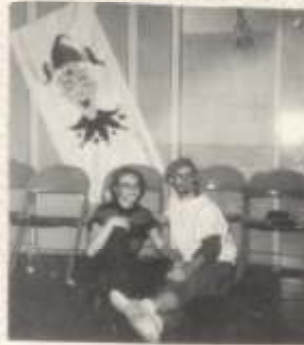
Which one is the joker????