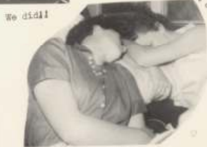
Put your hand on my shoulder!!