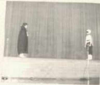
What is it???????