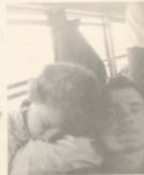
Isn't that romantic??