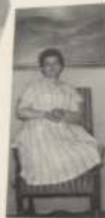
Dinner for two!