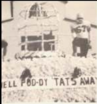
Junior Float--3rd Place