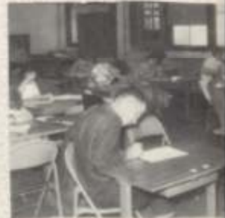
Oh so studious!!!