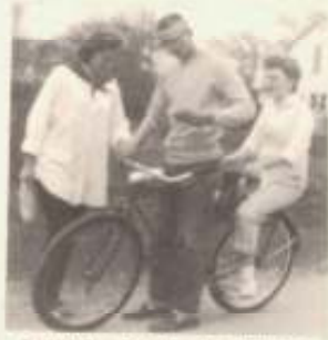
Bicycle Built for Three