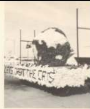
Junior Float--2nd Place