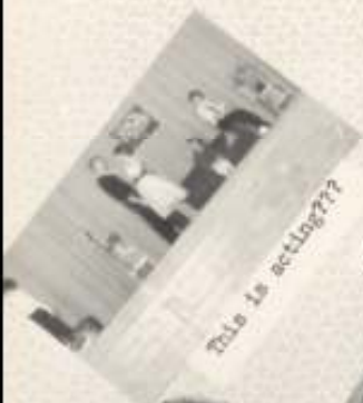
This is acting???