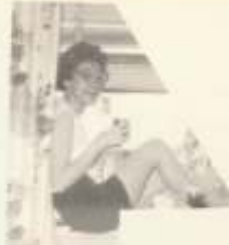
Have a pepsi!!