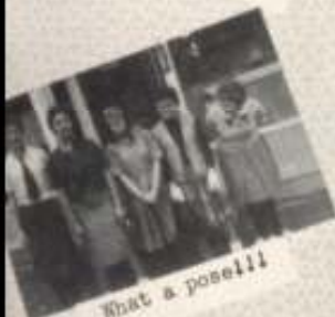
What a pose!!!